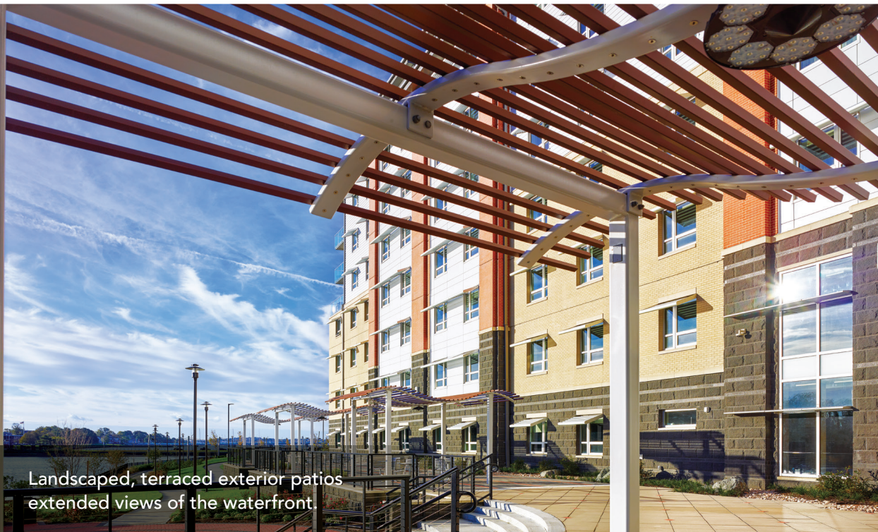
Landscaped, terraced exterior patios extended views of the waterfront.