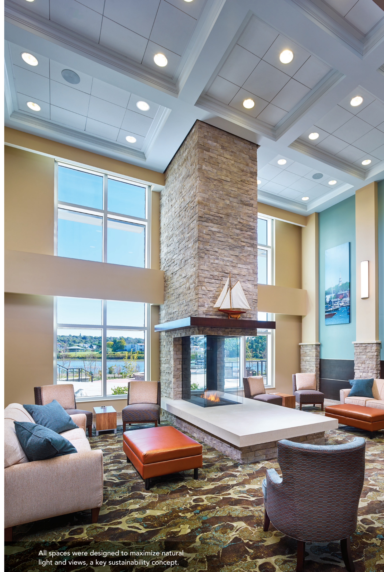
All spaces were designed to maximize natural light and views, a key sustainability concept.