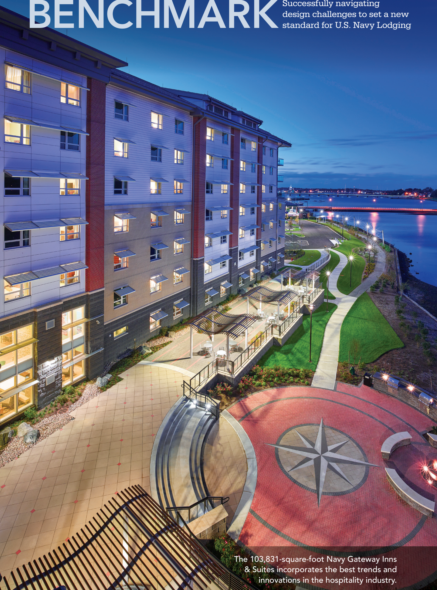
The 103,831-square-foot Navy Gateway Inns & Suites incorporates the best trends and innovations in the hospitality industry.

The location, beautifully placed on a scenic stretch of Coasters Harbor, presented a number of challenges and opportunities for Michael Baker International to address as lead designer and primary client conduit for the Navy Gateway Inns & Suites (NGIS) hotel in Newport, Rhode Island.